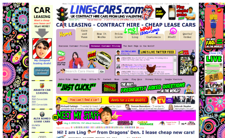
Figure 1: Terrible web design layout. Too many colours, too many figures, too many moving GIFs and animations. This website is too busy and difficult to read through.

There is, however, a fine line between good design and OVER-design. Adding too many animations can overload and bloat your page and make your Wiki seem tacky or overdone. As a reader, you do not want to wait ten seconds for an animation to load just so you can retrieve the information you quickly wanted to retrieve. You want there to be a good balance between aesthetics and usability. After all, the main purpose of your Wiki is to communicate information. Originally, our team had made use of crazy Java and JQuery scripts so that there would be animations on each page. But then we took a step back and looked at our Wiki from an outsider’s perspective and realized that all the flashiness was (and IS) unnecessary to convey the necessary information. Some interactivity and animation can be fun, but be careful: do not forget that having too much of one thing can be unhelpful and take away from your important content. Balance is KEY!